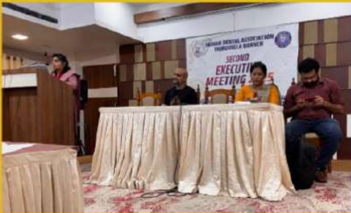
SECOND EXECUTIVE COMMITTEE MEETING ON FEBRUARY 14TH.