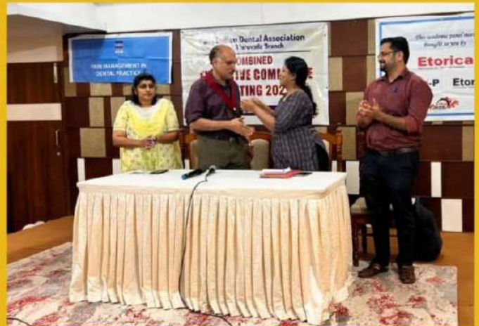
COMBINED EXECUTIVE ON JANUARY 7TH, 2025.